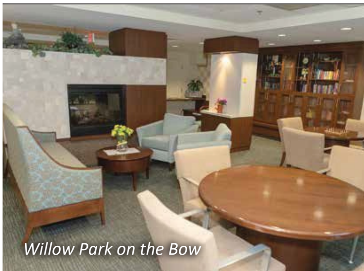
Willow Park on the Bow